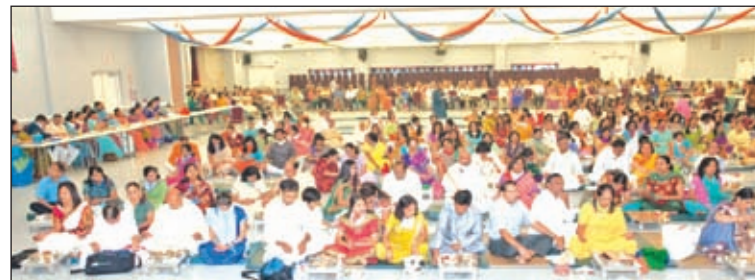
Left: Bhaktāmar Maha Mantra Poojan Vidhi ; Right: Devotees performing Maha Aarti .