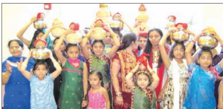
Youns girls carrying Kumbh as part of the celebration.

The JSMC Mela 2010 will be held on August 15 to celebrate India's Independence Day and Temple's 17th Anniversary. The major attraction at the mela will be a vendor fair, a fun fair, games, and live entertainment. For more information, please visit JSMC Web site - www.jsmcnline.org .